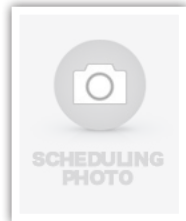
Al Farner Officer of the Day

All officers and their positions are on the VFW Post 10406 website