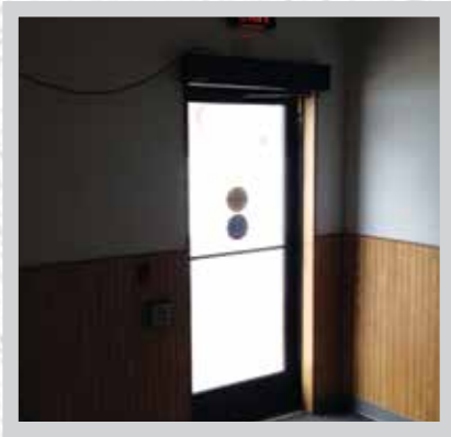
Back Door New Handicap Access Entrance For The Back Door