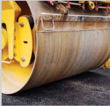
Parking Lot Improved Parking Lot With Extra Side Parking