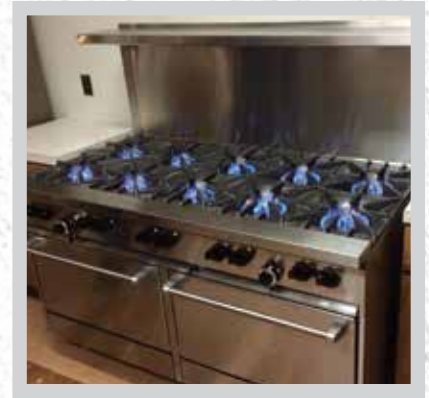
Kitchen: Stove/Oven New Commercial 10 Burner Stove With Double Oven

We have made improvements to our buildings back door with a handicapped entrance, improved our parking lot and added parking on the side of the building next to the handicapped door entrance, and we have started upgrades to our kitchen with a new commercial 10 burner stove with a double oven.