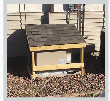
Outdoor Compressor Monthly Electric Bill Has Been Reduced Tremendously

We will be replacing and upgrading our bar room furnace to an energy efficient model as further repairs to the old furnace along with nonexistent parts make that furnace obsolete. We continue to invest in our veterans and community. Check out our website as it is always growing at www.vfwpost10406.org .