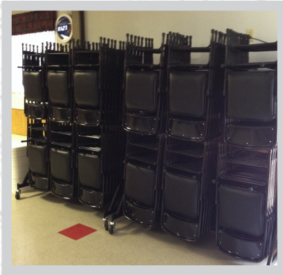
Chair Racks New Storage and Transportation Chair Racks