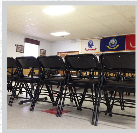
Hall Chairs New VFW Post 10406 Hall Folding Chairs