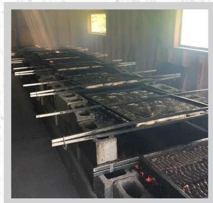
Chicken Q Volunteers Your Hard Work Is Greatly Appreciated - Thank You!

We were presented the White Hat at the VFW State Convention. There were only 10 EARNED out of 270 posts in the entire state of Wisconsin! This award is made possible because of the work YOU put in. Thank you for your dedication and let's earn another one. Check the website for more details. www.vfwpost10406.org .