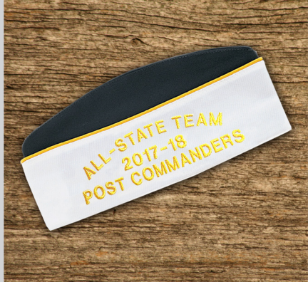
All-State Team Award Only 10 EARNED Out Of 270 Posts In The Entire State!